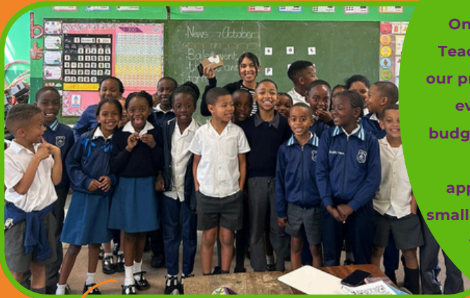
TERM 4 RESULTS